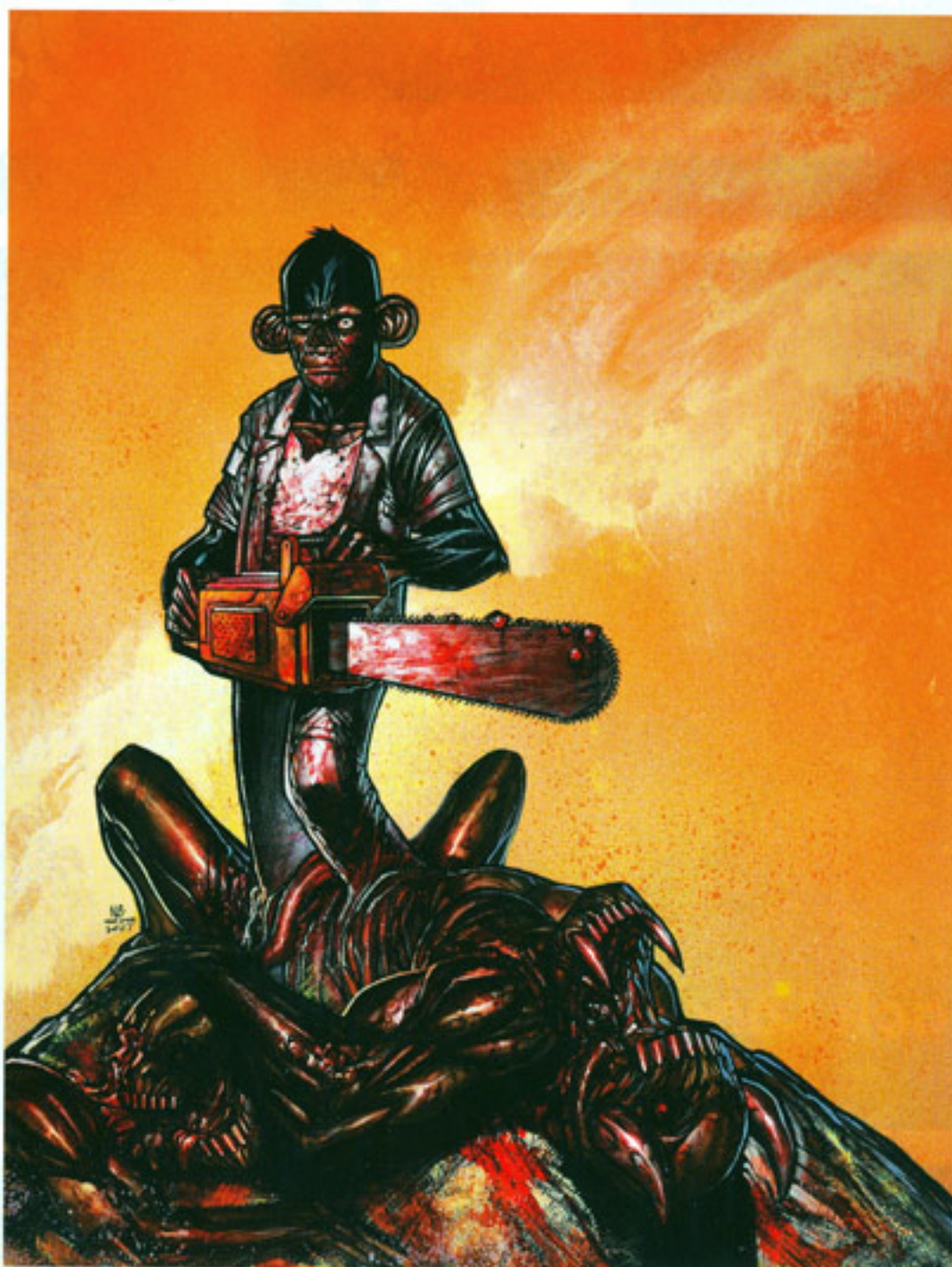
Reign Mixed-media 18" x 24" 2007

A few years back I was at the San Diego Zoo with my buddy Matt. We were both in front of the gorilla compound, standing separately, drawing the silverbacks. The place was crowded with families and baby strollers. One of the gorillas ripped up a fistful of grass and threw it right at Matt. We had a good laugh, and returned to drawing. A few minutes later I was drawing the same gorilla. All of a sudden a clump of dirt and grass comes sailing into my sketchbook from 30-feet away. Of all the people present, the gorilla had chosen only two people to attack with its grass bombs: Matt and me. We weren't standing next to each other during the attacks. The gorilla had separately singled us out from the crowd, understanding that we were doing something different from all the other surrounding people. Not just looking, but also drawing him. He was unhappy about it. —Nate Van Dyke