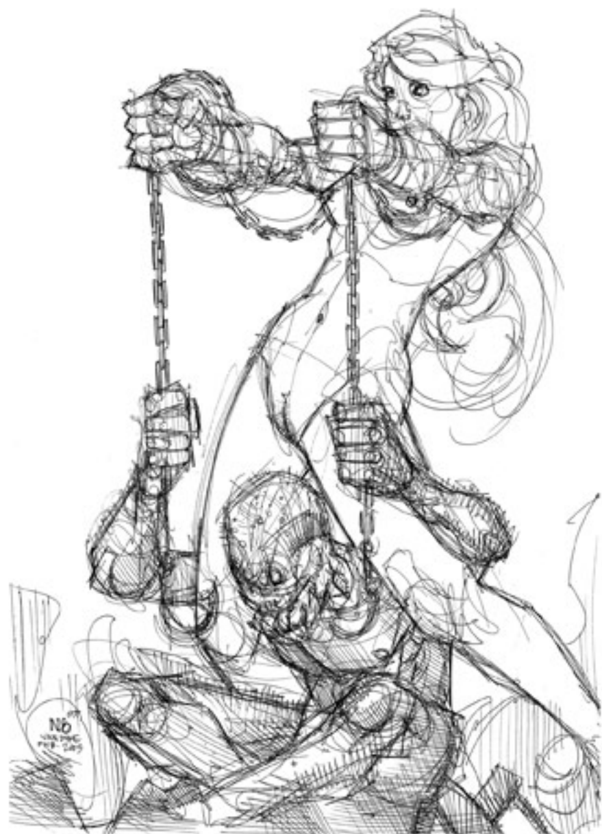
AT HELL'S HELM / SKETCH